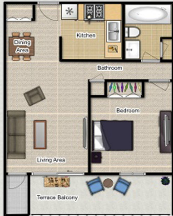
1 Bedroom | 1 Bath Prices Start at: $695/ month