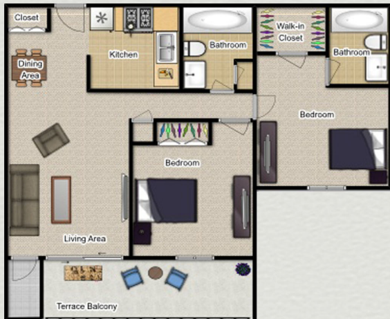
2 Bedroom | 2 Bath Prices Start at: $890/ month

Cider Mill offers a variety of floor plans and rental rates. Renovated homes available!